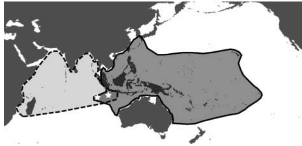
Figure 1. Christmas and Cocos Islands (represented by five-pointed stars) constitute a tropical marine suture zone located in the eastern Indian Ocean on the Indo-Pacific marine biogeographic border. At these islands, Indian (represented by lighter shaded area with dashed outline) and Pacific Ocean species (darker shaded area with solid outline) have come into contact and interbred.